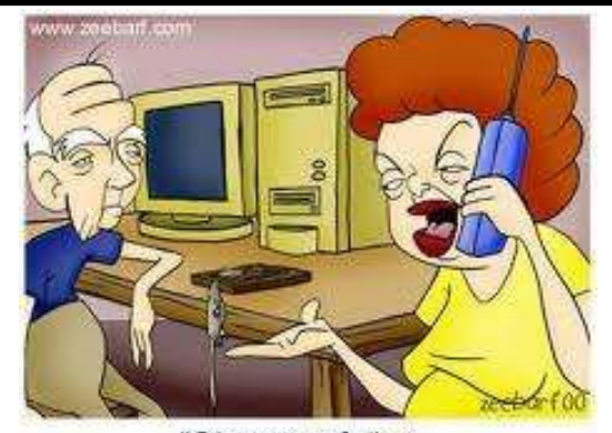
"Okay your father managed to get a mouse. Now how do we use it?"