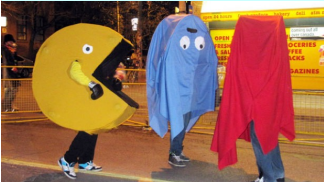
Who can resist PacMan and the Ghosts!

It's October. And Halloween is on it's way. I know it's 30 days or so until Halloween, but good Halloween costumes don't just happen. Any self-respecting geek must start planning their costumes NOW! Here's a few suggestions: