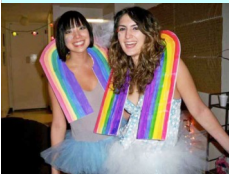
Duuuude! I see double rainbows!